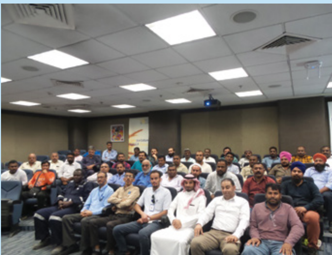
PARTICIPANTS AT THE SAFETY AWARENESS SESSION

At Almajdouie Logistics, we know that investing in our employees is vital to our continued success, which is why we offer a number of training and development programmes and work with our partners to develop our employees' skills in the best possible way.