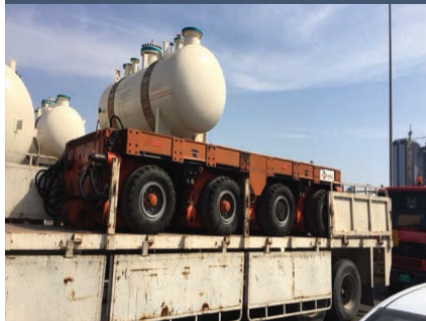
DOOR TO DOOR