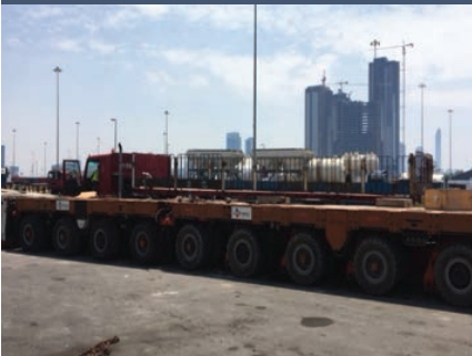
CJ | KOREA