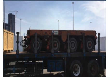
DUBAI TO KUWAIT