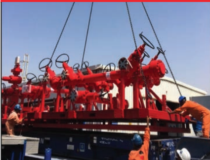
KERUI | CHINA