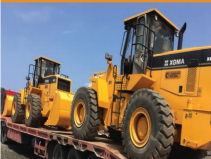
XGMA | UAE