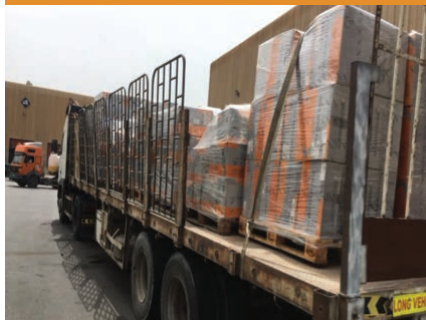
DOOR TO PORT