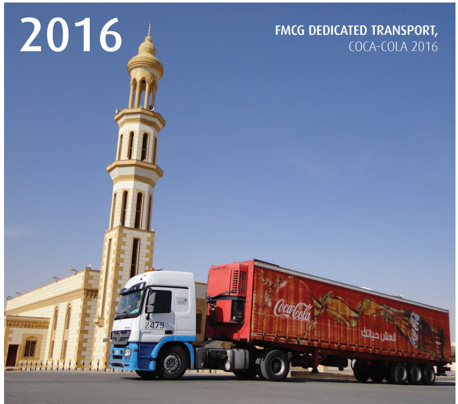
FMCG DEDICATED TRANSPORT, COCA-COLA 2016