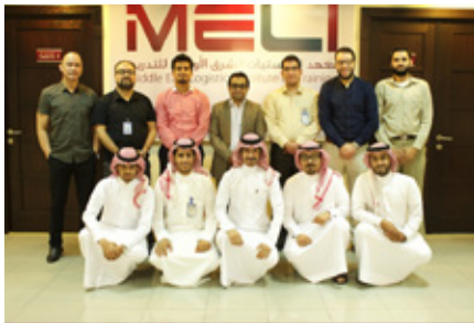
Al-Marai Transport Managers Certified Course

50 years of pioneering the logistics sector in the Middle East, Almajdouie established a specialised training institute in 2010, namely, Middle East Logistics Institute (MELI). The first of its kind in KSA, MELI envisions building globally competitive logistics and SCM capacities for Middle East's business community. In this feature, we share with our readers some of MELI's current activities with a view of the benefits MELI courses offer its clients and the community.