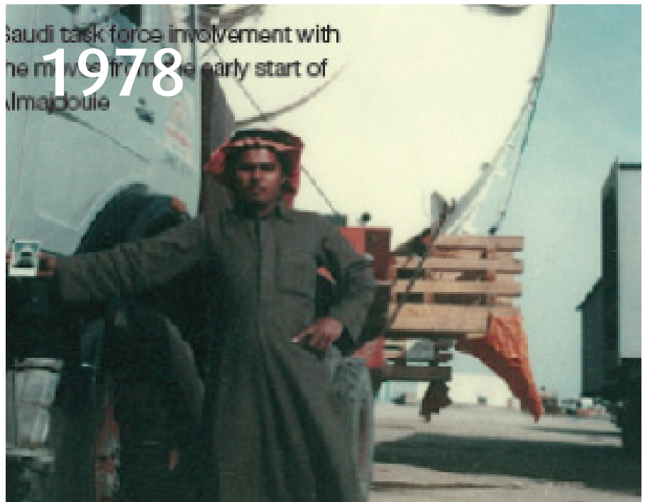
1978 FIRST HEAVY LIFT, RIYADH CEMENT