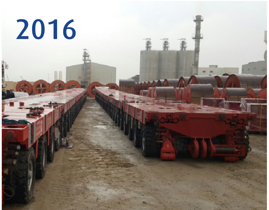
2016 OFFSHORE HEAVY LIFT, ABU DHABI