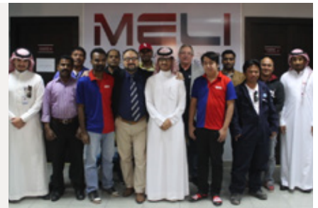
NAQEL Express Team ADR International Program