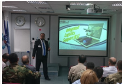
MELI Trains 53 NATO officers